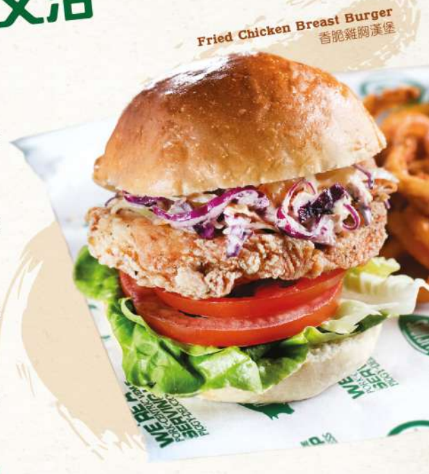
Fried Chicken Breast Burger 香脆雞胸漢堡