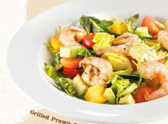
Grilled Prawn & Avocado Salad 牛油果香芒大蝦沙律