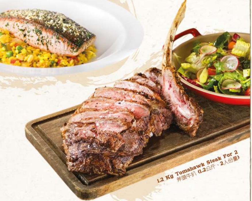
1.2 Kg Tomahawk Steak For 2 斧頭牛扒 (1.2公斤、2人份量)