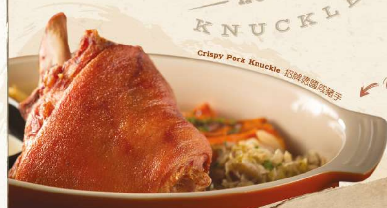
PORK HO SIK KNUCKLE Crispy Pork Knuckle 招牌德國咸豬手

How does The Salted Pig - PORK KNUCKLE get its taste? The Salted Pig 招牌德國咸豬手誕生的故事 The Salted Pig Pork Knuckle is a very unique dish as it takes a 3-day brining & cooking process to create a tender, juicy, flavorful knuckle with a very crispy, crunchy skin. 經過3日3夜鹽水漬、低溫慢煮以及高溫油炸的千難百難，才能炮製出外皮金黃酥脆、 內裡甘嫩豐香、直立「開」的招牌咸豬手！