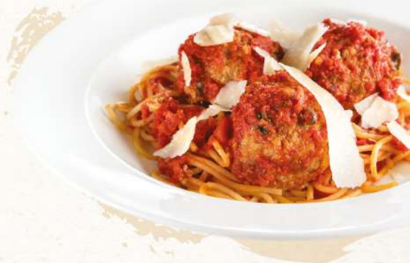
Spaghetti & Meatballs 巴馬臣芝士蕃茄肉丸意粉