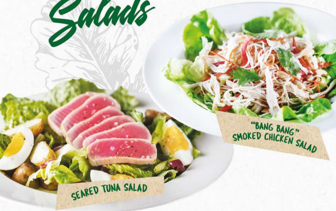
SEARED TUNA SALAD