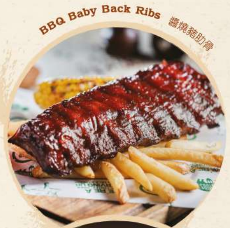
BBQ Baby Back Ribs 醬燒豬肋骨