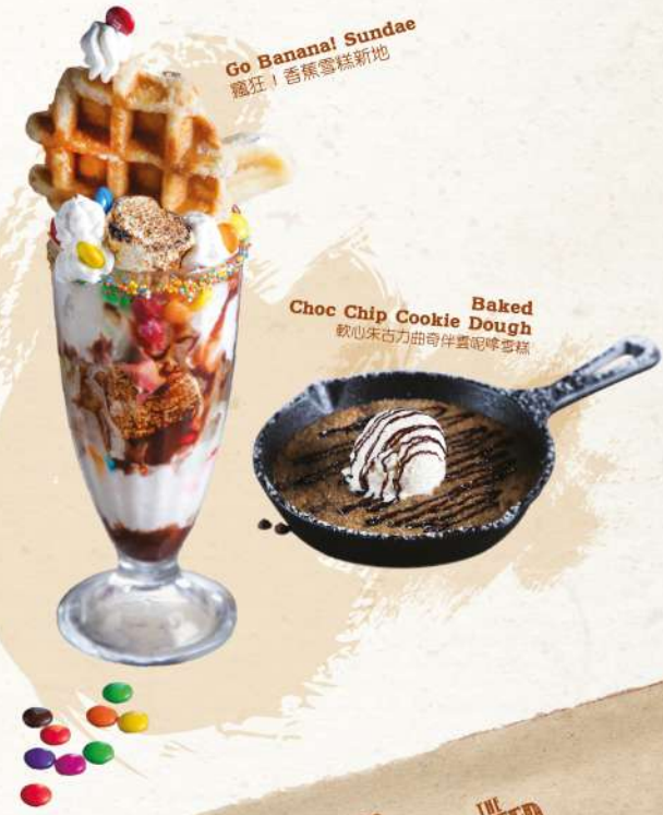
Go Banana! Sundae 瘋狂! 香蕉雪糕新地