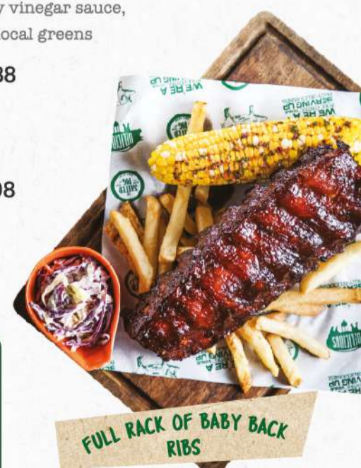
FULL RACK OF BABY BACK RIBS