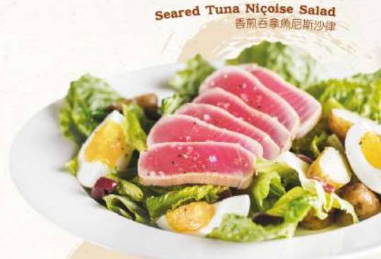
Seared Tuna Niçoise Salad 香煎吞拿魚尼斯沙律