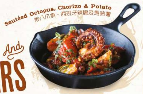
Sautéed Octopus, Chorizo & Potato 炒八爪魚、西班牙辣腸及馬鈴薯