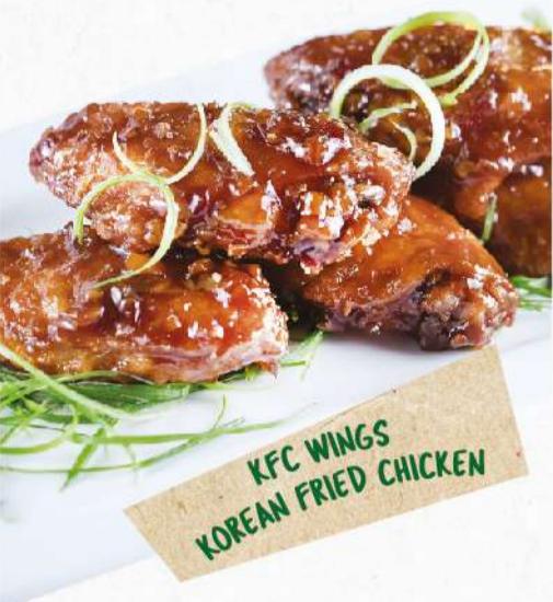
KFC WINGS KOREAN FRIED CHICKEN