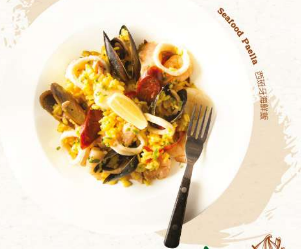
Seafood Paella 西班牙海鮮飯