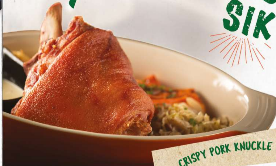
CRISPY PORK KNUCKLE