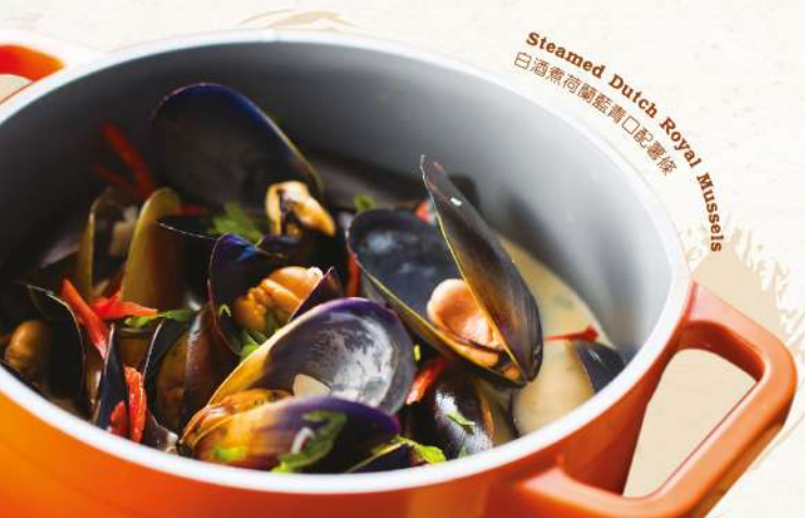
Steamed Dutch Royal Mussels 白酒煮荷蘭藍青口配薯條