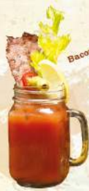
Bacon Bloody Mary