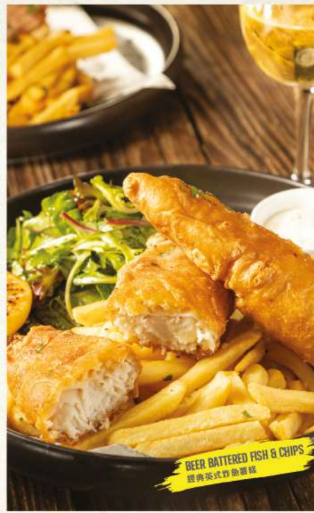
BEER BATTERED FISH & CHIPS 經典英式炸魚薯條