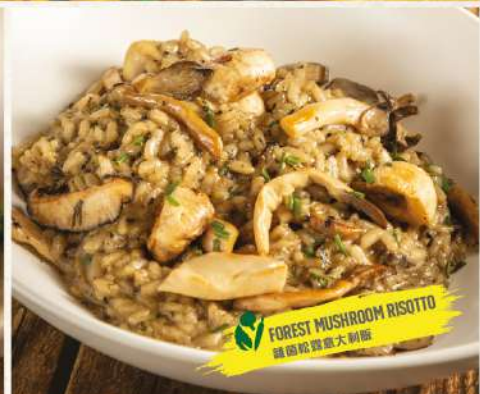
FOREST MUSHROOM RISOTTO 雜菌松露意大利飯