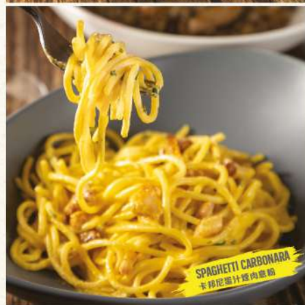
SPAGHETTI CARBONARA 卡邦尼蛋汁煙肉意粉