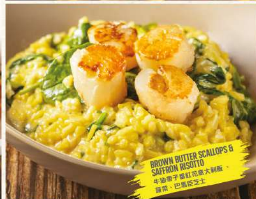
BROWN BUTTER SCALLOPS & SAFFRON RISOTTO 牛油帶子番紅花意大利飯、菠菜、巴馬臣芝士

shrimps, clams, mussels, calamari, fish fillets, chorizo, smoked chicken, green peas, olives 西班牙海鮮飯、蝦、大蜆、青口、魷魚、魚柳、辣肉腸、煙雞肉