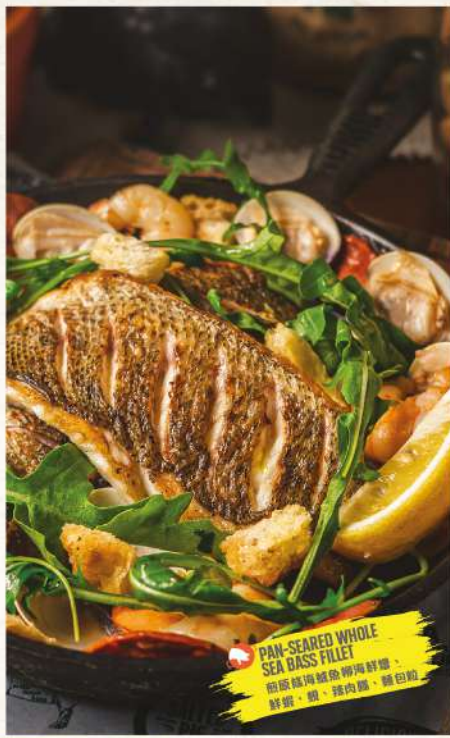
PAN-SEARED WHOLE SEA BASS FILLET 煎原條海鱸魚柳海鮮燴、鮮蝦、蜆、辣肉腸、麵包粒

French fries choose your sauce: beef gravy/chimichirri/pepper sauce 燒肉眼牛扒(12安士)、薯條 選擇醬汁: 肉汁/阿根廷青醬/黑椒汁