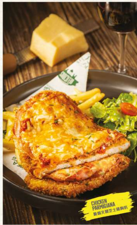
CHICKEN PARMIGIANA 脆焗火腿芝士雞胸扒