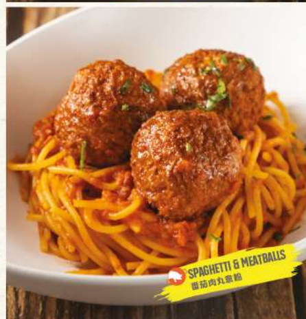
SPAGHETTI & MEATBALLS 番茄肉丸意粉