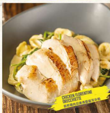
CHICKEN FLORENTINE ORECCHIETTE 高粉雞肉忌廉青醬貓耳朵粉

shrimps, clams, mussels, calamari, fish fillets, chorizo, smoked chicken, green peas, olives 西班牙海鮮飯、蝦、大蜆、青口、魷魚、魚柳、辣肉腸、煙雞肉